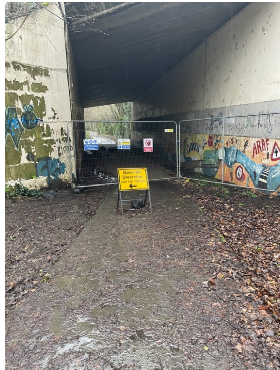
Photos 23 & 24 – Approx 150m section requiring some vegetation particularly overhead height clearance between Bangor & Halfway Bridge. Grid Ref: SH 59863, 7002.