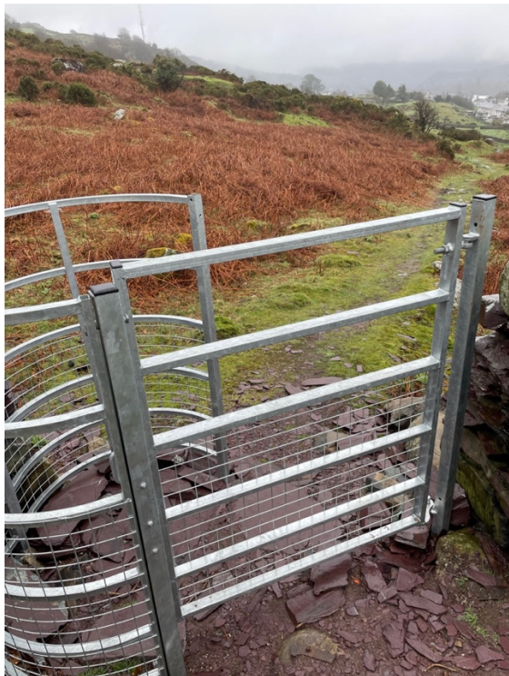
Photo 78 - Steps down to Bethesda from Rachub, Grid Ref: SH 62532,67109